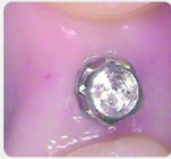
Fig. 9: Closed implantation carried out with MIMI®