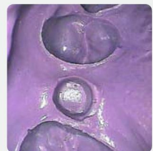
Fig. 18: Conventional impression