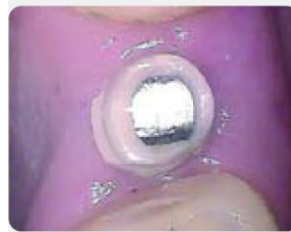
Fig. 15: Inserted zirconium Prep-Cap