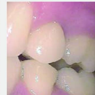
Fig. 20: Cemented in zirconium crown just four days after implantation

In addition to our homepage, please also visit the homepage of the independent "Champions Forum" at www.champions-forum.de , the website for Champions users!