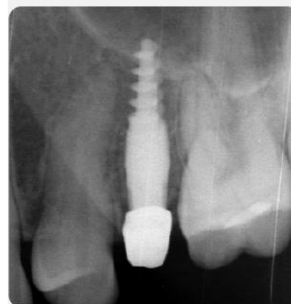
Fig. 17: X-ray check-up