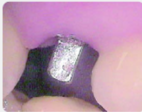
Fig. 11: Closed implantation carried out with MIMI®