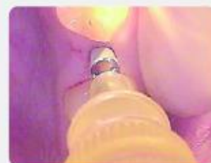
Fig. 7: With the integrated insertion aid, the Champions® - square-shaped implant is first inserted by hand up to approx. 25 Ncm "condensing laterally".