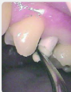
Fig. 14: ...before it is cemented with a solid glass ionomer

The minimal bone cavity must be well palpable in all five dimensions. (Fig. 6)