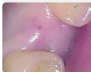
Fig. 2: Preoperative clinical situation