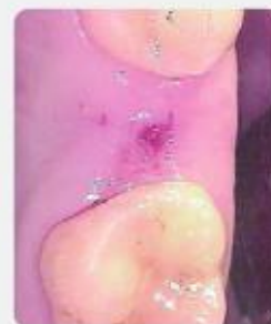
Fig. 5: MIMI® bone cavity preparation performed slightly palatally...