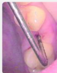
Fig. 6: ...which is checked by bone cavity monitoring ("BCC": Bone Cavity Check). All five dimensions must be palpable and surrounded with bone.