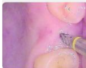
Fig. 4: MIMI® bone cavity preparation performed slightly toward the palate