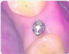
Fig. 10: Closed implantation carried out with MIMI®