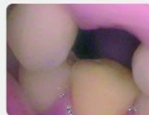
Fig. 3: Preoperative clinical situation