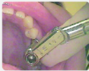
Fig. 8: The final implantation is done with at least 40 Ncm using the metal insertion aid and a torque key.