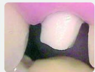
Fig. 16: Inserted zirconium Prep-Cap