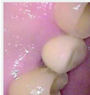
Fig. 19: Cemented in zirconium crown just four days after implantation