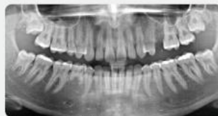
Fig. 1: Starting OPG imaging

Following local infiltration vestibularly and palatally - even before the drilling process - I insert the tip of the yellow Champions® drill (without rotating) transgingivally at the planned implantation site until I hit bone. This way I obtain the exact mucosa thickness at the area of the operation, the mm-value of which I add to my planned bone depth. Then you drill at approx. 250 rpm with the green angular piece tending slightly palatally (Fig. 4). The already conical, yellow drill features every 2 mm start at 10 mm black laser markings so that at 16 mm I am able to insert a 10 mm Champion® transgingivally (with a 4 mm mucosa thickness), since as is generally well known it is very conducive to countersink all implant threading 1-2 mm subcrestally.